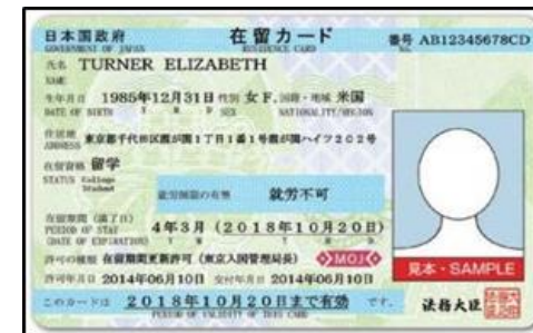
Resident Card Both visa and expiration date must be valid.