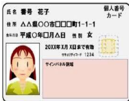
My Number Card (Kojin Bango Card) Pictured Form Only

Must present one of the below listed official IDs: