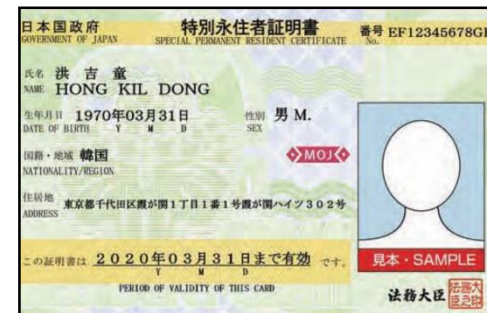
Special Resident Permanent Certificate